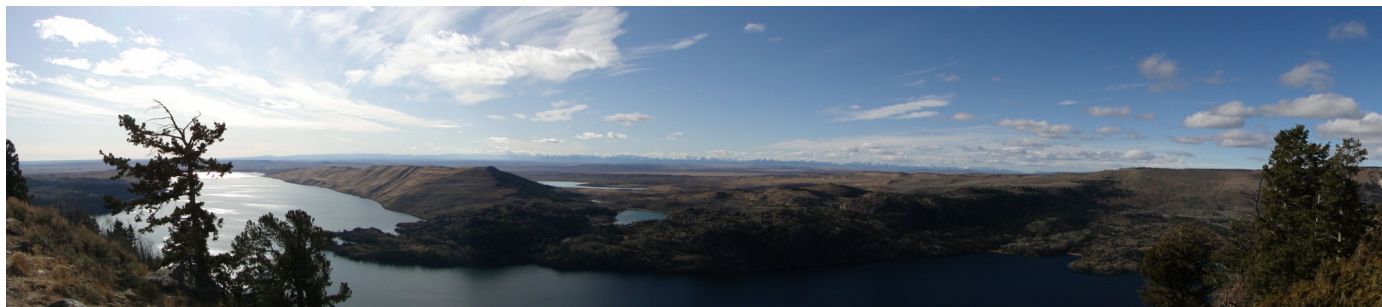
Above Fremont Lake up the road to Elkhart Park

Welcome to St. Andrew's in the Pines and St. John the Baptist's Episcopal Churches