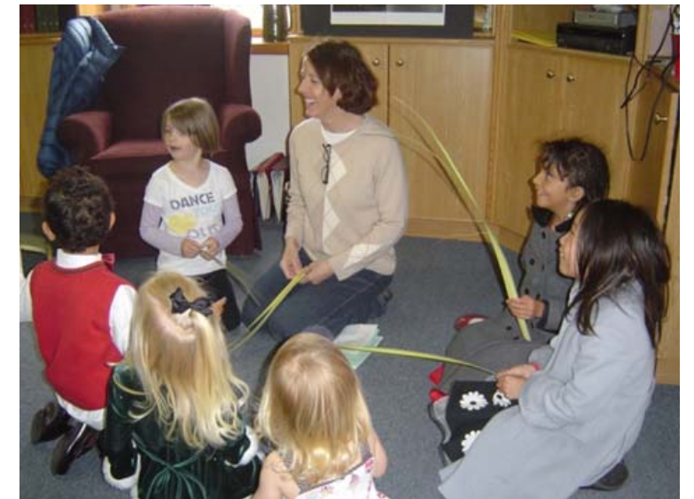
St. Andrew's Sunday School Children – Discussing the Gospel Story – Palm Sunday