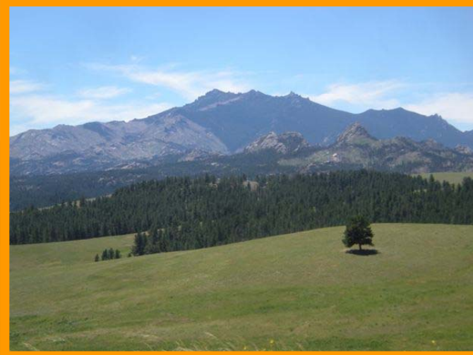
Scenery near the Wyoming Wilderness Camp

My week at the Junior High Adventure/Wyoming Wilderness Camp was an amazing experience. It taught me how to reach my goals and how God could help me with them. For example, when I got to camp I wasn't good with heights, but a day or two later we did the high ropes courses. I failed the first two but on the third one, the Giant's Ladder, my partner and I used teamwork to overcome our fear. We did tons of other fun stuff, too, like hiking at Friend Park which is right next to Laramie Peak. It had beautiful scenery that we got to look at while eating lunch at a big rock that had been split in two. We also rock climbed and had a 5 or 6 mile mountain bike ride and that was also amazing because of the scenery. Usually we would ride to an ice cream shop but that ride was rained out, unfortunately. There was one thing I looked forward to three times a day. Breakfast, lunch and dinner - the food was the best! The cook and her granddaughter made the best camp food I've ever had. Usually you would consider the food at camps gross or frozen in the middle or something like that, but almost all of the food was hand made and delicious. These are only a few of my favorite activities at the Junior High Adventure camp. I had a wonderful time and if you decide to go next year I'm certain you will have a great week.