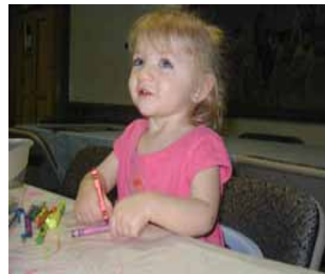
Testing out our teamwork abilities during Church Family Night!

THE FOCUS WILL BE NEW TESTAMENT PARABLES