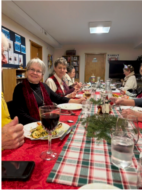
A good time was had by all at the St. Andrew's Christmas Party!

beautiful singing, worship leading at Heritage Home and the Sublette Center, the poinsettia gifts, the lovely Evening Prayer at St. Andrew's – it is all very much appreciated!