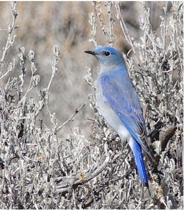
Male Bluebird